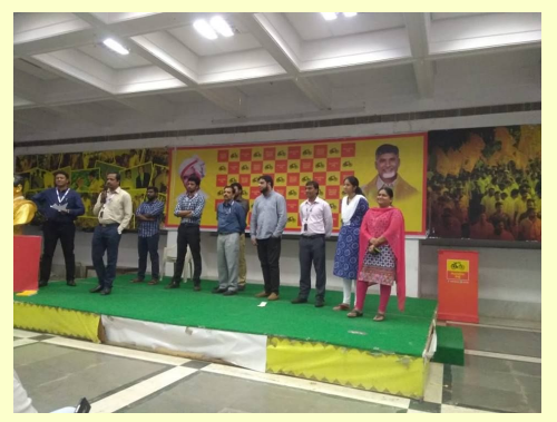
Job aspirants during Job drive @NTR Trust-SDC-Hyderabad