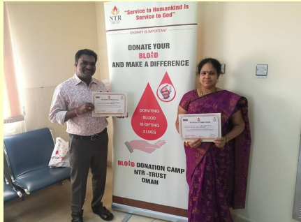
Distribution of certificates to Voluntary Blood donors of Oman during LBD 2019

6. A Blood donation camp was organized by NTR Trust at Yelamanchili & Bakkannapalem, Visakhapatnam. 67 donors voluntarily came forward to donate blood.