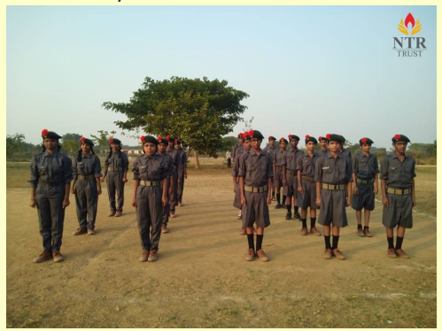
Students during their NCC training @ NTR High School, Warangal

3. An English Essay Writing Competition was held at NTR High School, Warangal. The students were asked to write on the topics "Conservation of Air, Water & Soil" or "Importance of Republic Day". The essay writing competition was judged on the basis of vocabulary, presentation and creativity. The purpose of this competition is to encourage the students to enhance their thinking & writing skills.