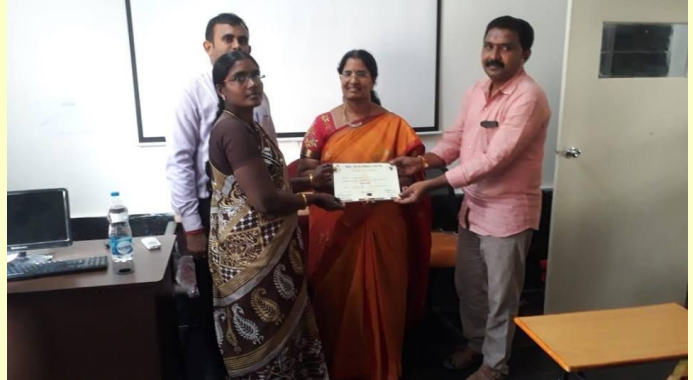
Certificate distribution for Rural Women @ NTR Trust- SDC-Vinukonda

3. NTR Trust organized a Job Drive at Skill Development Centre (SDC)-Hyderabad. More than 150 young aspirants attended the job drive. Renowned companies like IIC Technologies, GENPACT, KARVY, HDFC BANK, LMV financial Services were present. 90+ aspirants got offer letters.