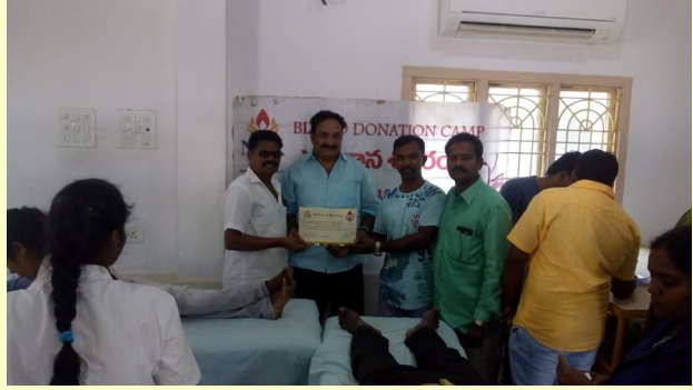
Voluntary blood donation in progress