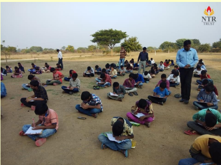
Students during Essay Writing Competition @ NTR High School, Warangal