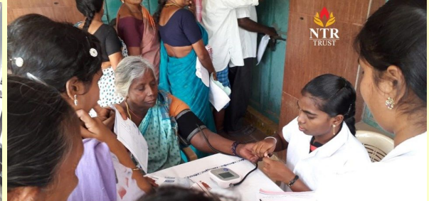
Medical check-up in progress @ Gudlavalleru Village