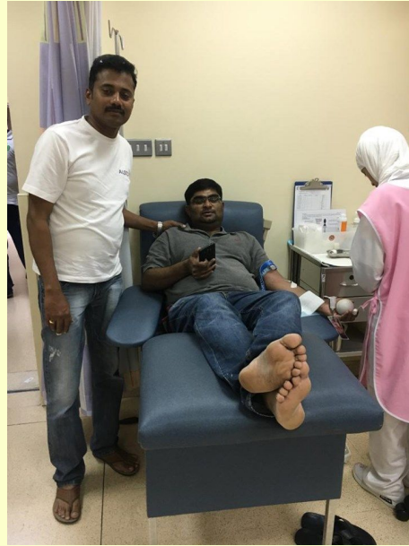
Voluntary blood donation in progress