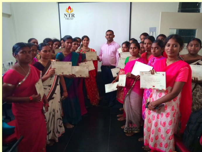
Certificate distribution for Rural Women @ NTR Trust- SDC-Vinukonda