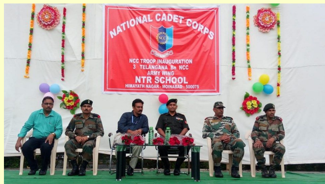
During NCC Army Wing Introduction in NTR Model School Hyderabad