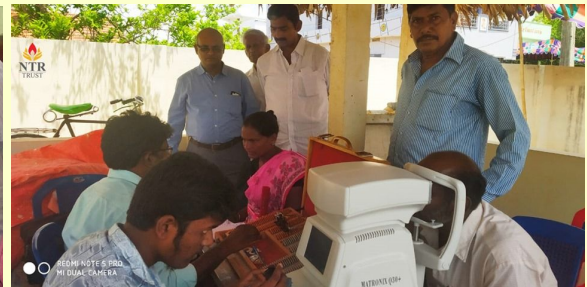
Medical check-up in progress @ Billapadu village