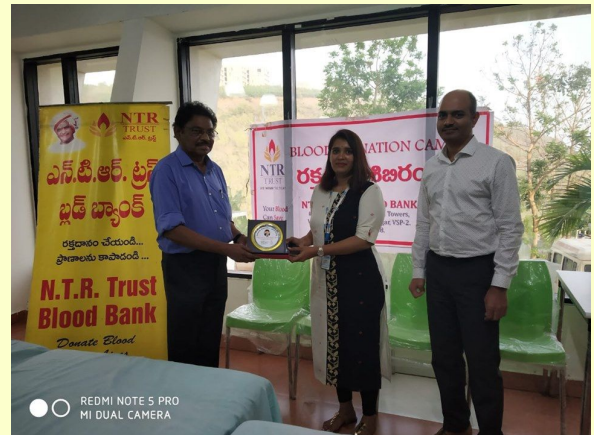
Felicitation of voluntary Blood donors