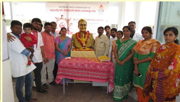
96th Birth Anniversary celebrations of Dr. Nandamuri Taraka Rama Rao Garu