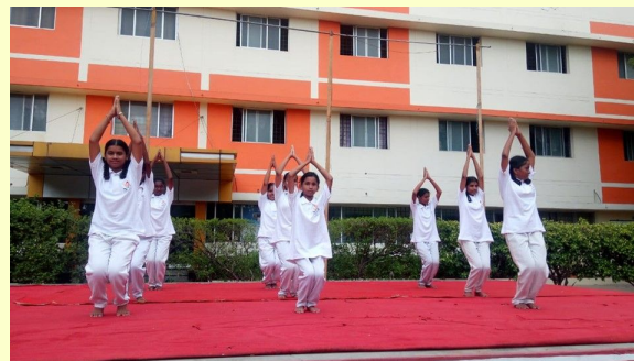
Students showcased various Asanas during International day of Yoga @ NTR Model School, Hyderabad