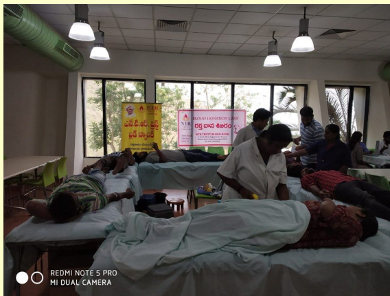
Voluntary blood donation in progress