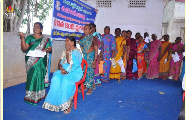
Eye check-up in progress @ Uppugundur village