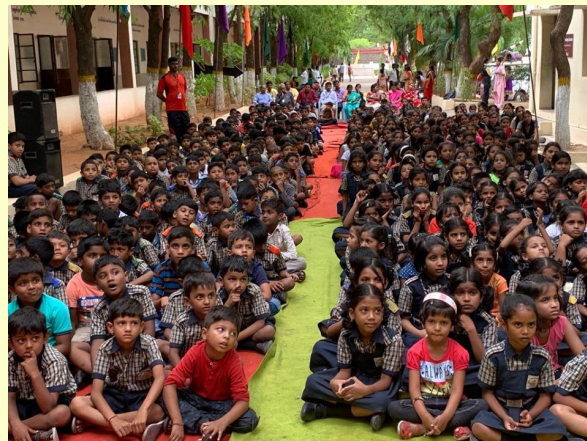
Welcoming the students for the new Academic Session 2019-2020 @ NTR Educational Institutions