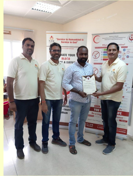
Felicitation of voluntary Blood donors