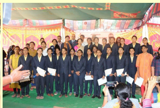
Managing Trustee Smt. Nara Bhuvaneshwari with NTR Junior & Degree College Students @ Hyderabad