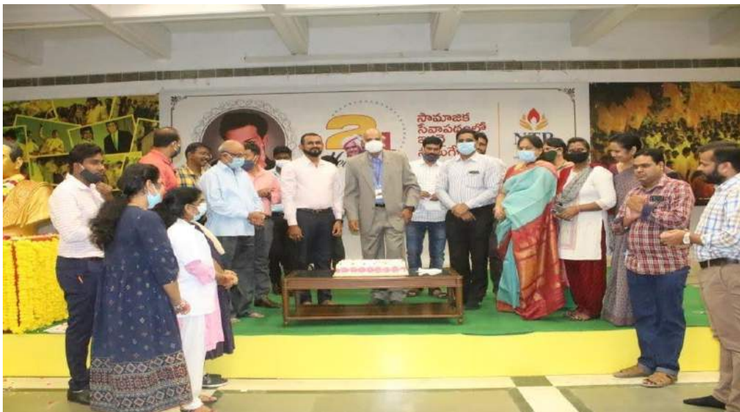
24 th Formation Day celebrations of NTR Memorial Trust.

NTR Educational Institutions also paid glowing tributes to our beloved leader late Dr. Nandamuri Taraka Rama Rao garu on this occasion at our Schools and College premises.