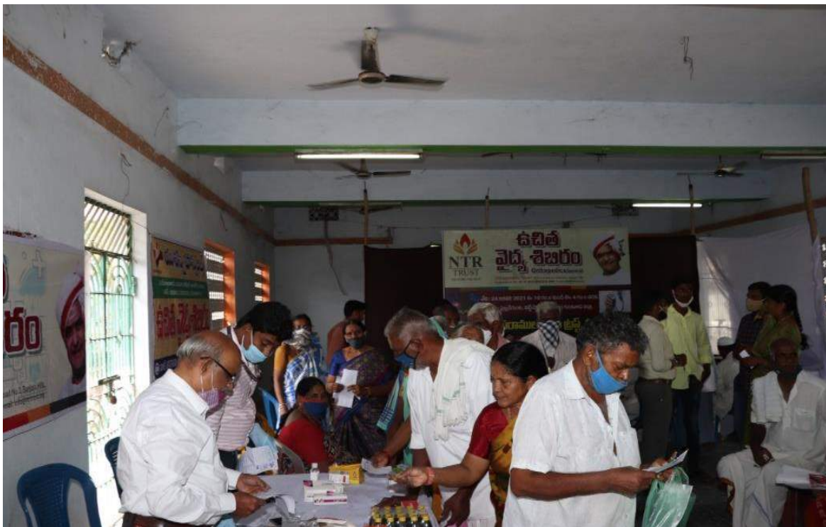
Health check-up camp at Health Pulladigunta, Guntur

The following objectives were achieved during the camp: Measurement of the Pulse, Blood Sugar monitoring to screen Diabetes, Cardiology, Pediatric, Blood Pressure, Height, Weight, and BMI.