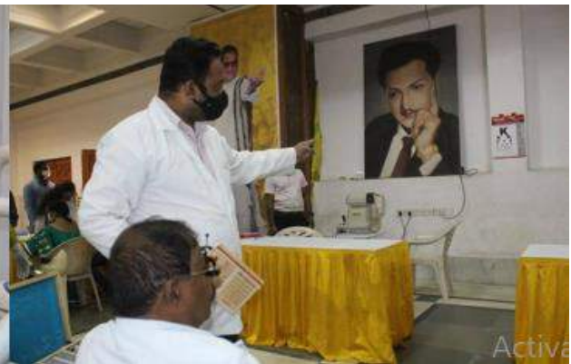
Eye Check up

NTR Educational Institutions also paid glowing tributes to our beloved leader late Dr. Nandamuri Taraka Rama Rao garu on this occasion at our Schools and College premises.