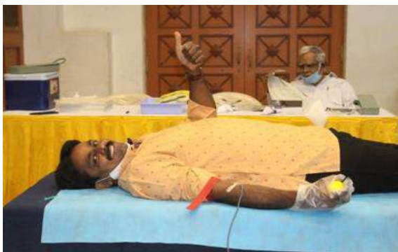
Blood Donation Program

LBD-2021 has been held in both Andhra Pradesh & Telangana States at various locations in collaboration with Red Cross, Rotary Club, Lions Club, Govt. Hospitals and other Blood Centers with support from Volunteers. Thousands of volunteers donated blood to save precious lives at our 3 Blood Centres - Hyderabad, Visakhapatnam & Tirupati.