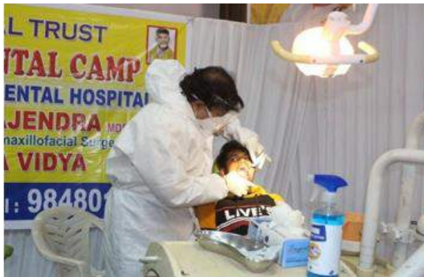
Dental Check up

Measurement of the Pulse, Blood Sugar monitoring to screen Diabetes, Ophthalmology, Dental, ECG, Blood Pressure, Height and Weight measurement and BMI. Our health care camp created a general sense of well being and contentedness among the local population.