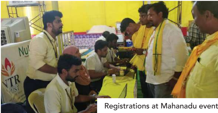
Registrations at Mahanadu event

Nutriful is a fitness App that focuses on achieving overall health. Keep track of your progress through any fit band of your choice. Connect it to the App on your phone and work towards getting healthy. Right away, you can track your daily health data with our ingenious workout tracker, sleep tracker, health data, and daily nutrition intake tracker. Access a dietician and nutritionist for a consultation from the App and gain insights on setting goals towards an immune and healthy you.