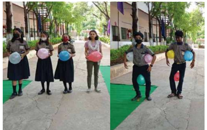
On reopening day the school organised programs