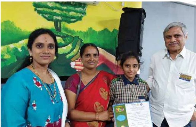
'RYLA' (Rotary Youth Leadership Awards) competition