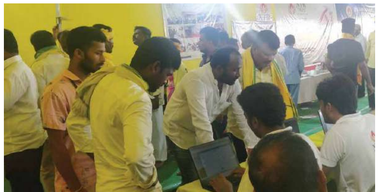
Creating awareness and educating common public on healthy lifestyle through Nutriful APP