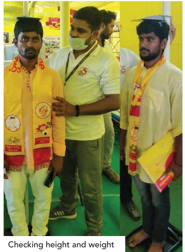
Checking height and weight