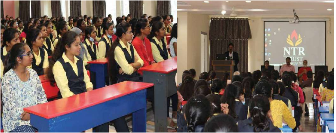
We conducted FRESHERS INDUCTION PROGRAMME for Intermediate students on 1st of July, 2022.