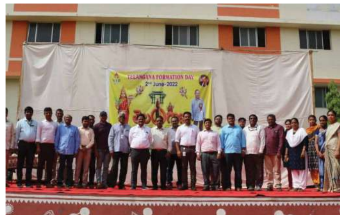
Telangana State Formation Day was celebrated on 2nd June, 2022