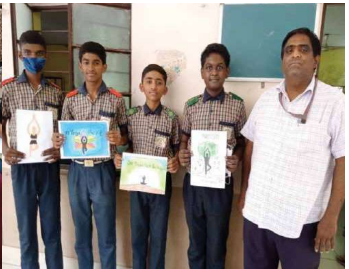
Painting competitions were conducted