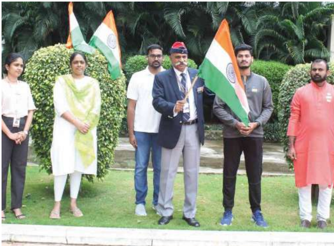
Nutriful celebrated the 75th Independence Day with a lot of patriotic fervor and enthusiasm by conducting Fitness Training on 15th Aug, 2022