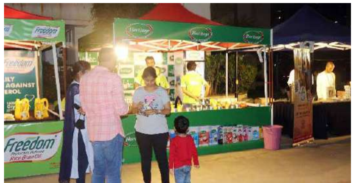
Best Chef Event participated at Aparna Cyber zone by Nutriful