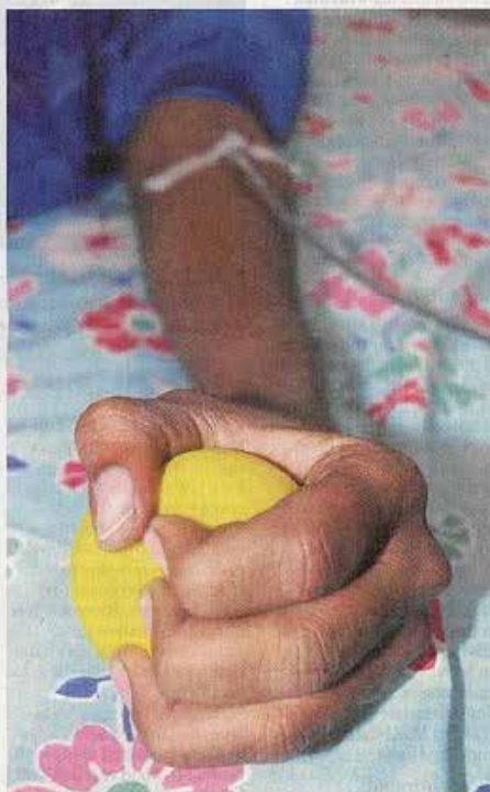
BLOOD BROTHERS: With well-managed transfusion therapy, a thalassemic patient can live well into adulthood.

er, are not the only possible treatment.