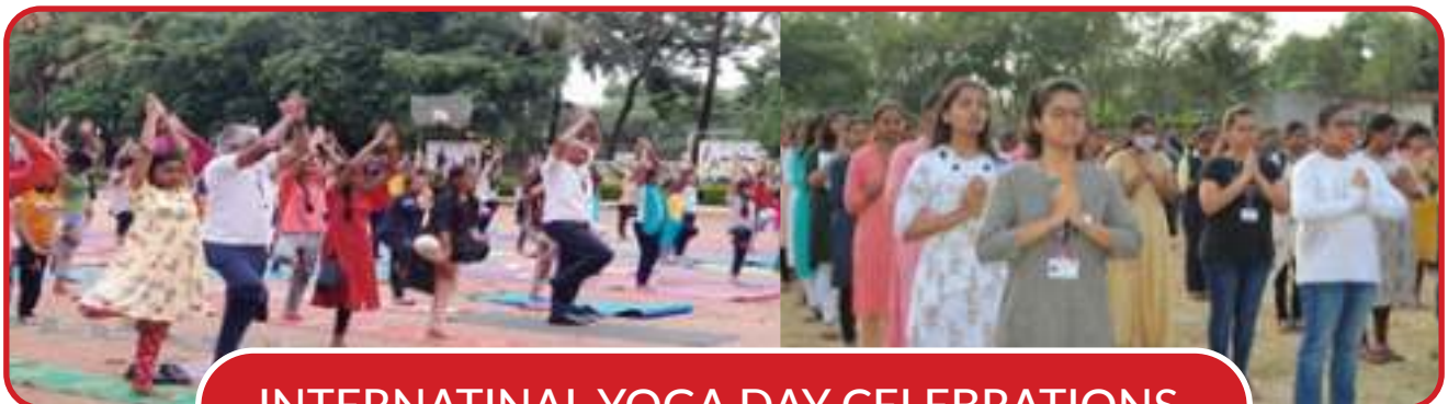
INTERNATINAL YOGA DAY CELEBRATIONS.