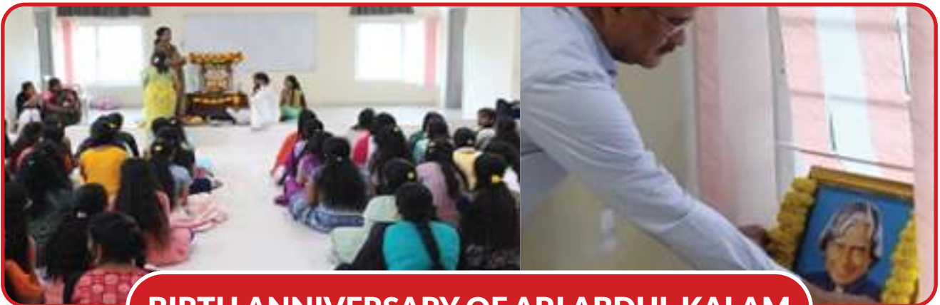
BIRTH ANNIVERSARY OF APJ ABDUL KALAM