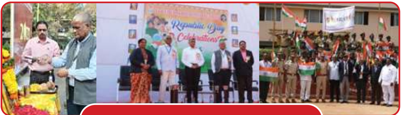
REPUBLIC DAY CELEBRATIONS