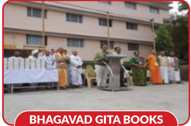
BHAGAVAD GITA BOOKS DISTRIBUTION