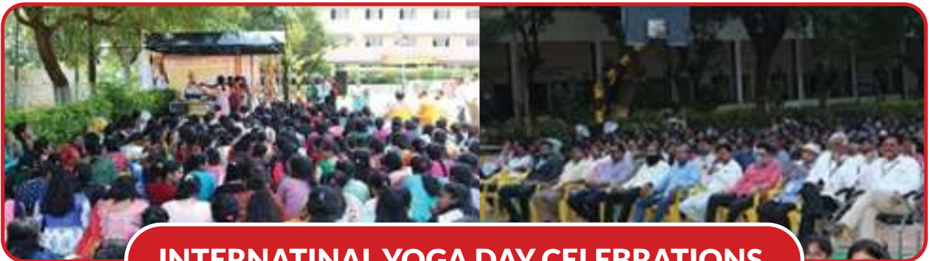
INTERNATINAL YOGA DAY CELEBRATIONS.