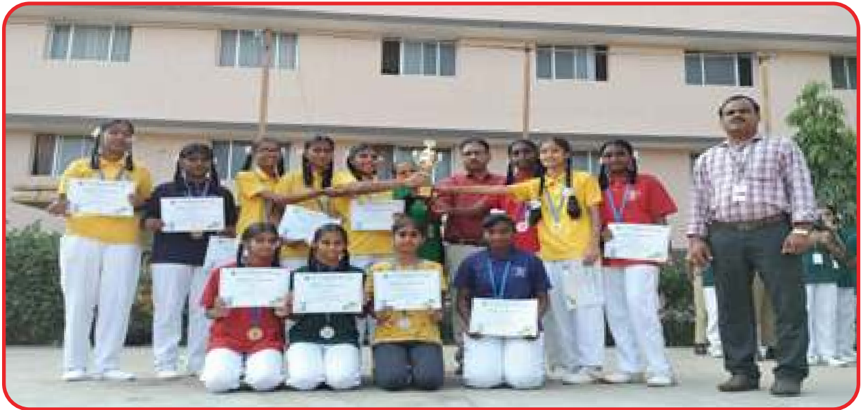
Students Secured Second Prize in Interschool Volleyball Competition