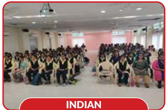
INDIAN CONSTITUTION DAY