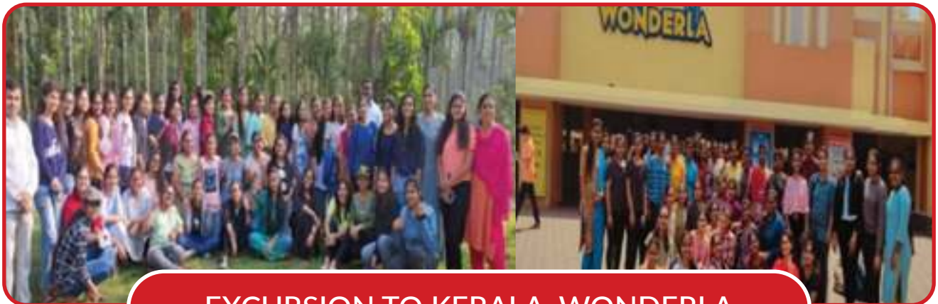
EXCURSION TO KERALA, WONDERLA