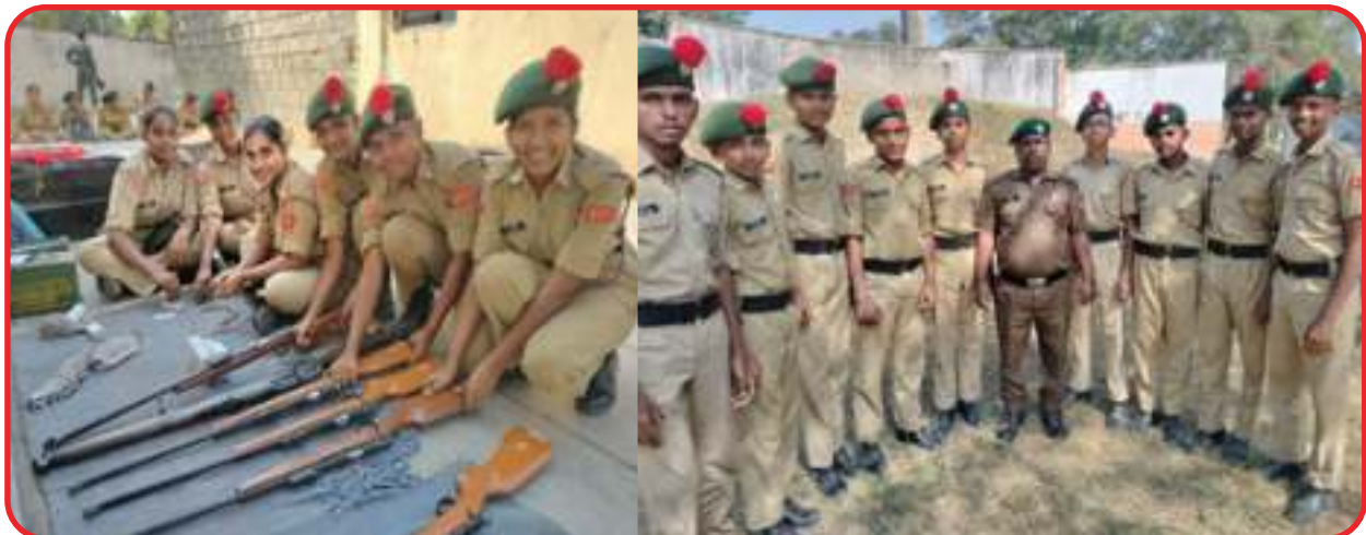
NCC Students attended the Pre-RDC-III NCC Camp, at Secunderabad