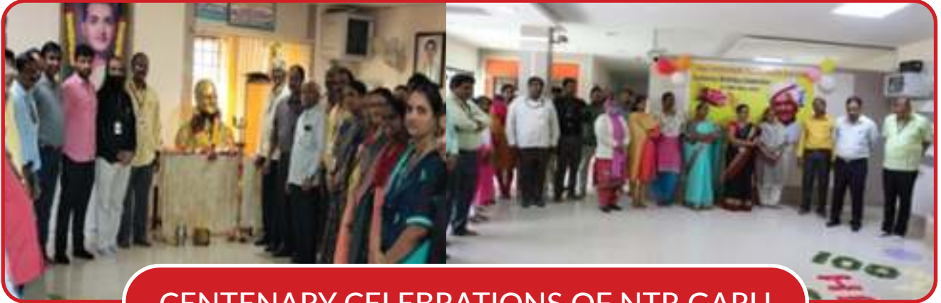
CENTENARY CELEBRATIONS OF NTR GARU